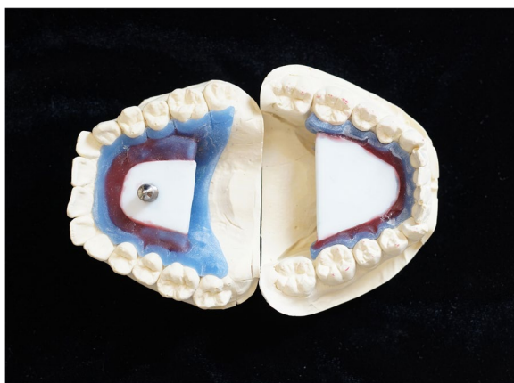
Fig. 1 Gothic arch tracer

infraorbital point as a reference, so the reference plane for the examination was the Frankfort horizontal plane. Before starting the digital analysis, an arbitrary axis calibration was performed: the position of the mandible transmitter was adjusted to the Frankfort horizontal plane with a calibration pin of known length. To determine the intercondylar axis, the lateral poles of the condyles were zeroed as well.